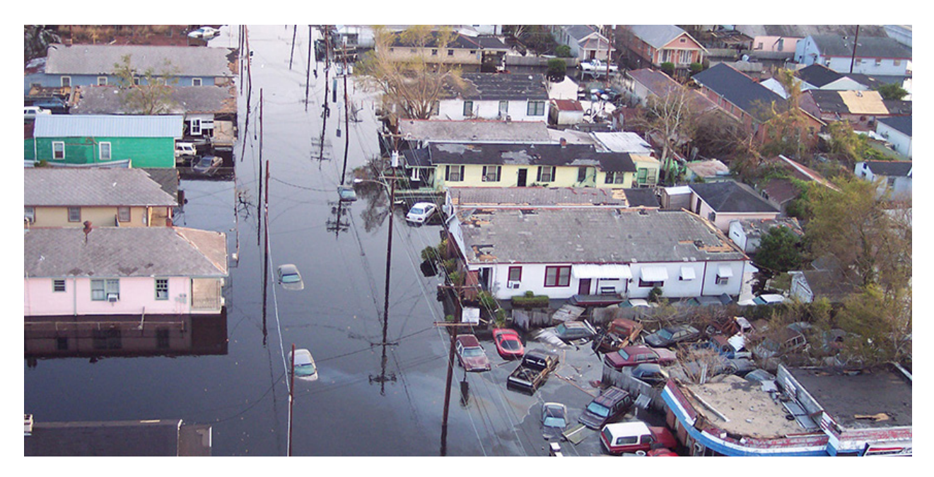
Hurricane Katrina took over 1,800 lives and caused over $108 billion in damages. The hurricane was particularly devastating to New Orleans, Louisiana, where it displaced millions of people.<sup>xx</sup>

By mitigating 1% more homes than Strategy 1, the