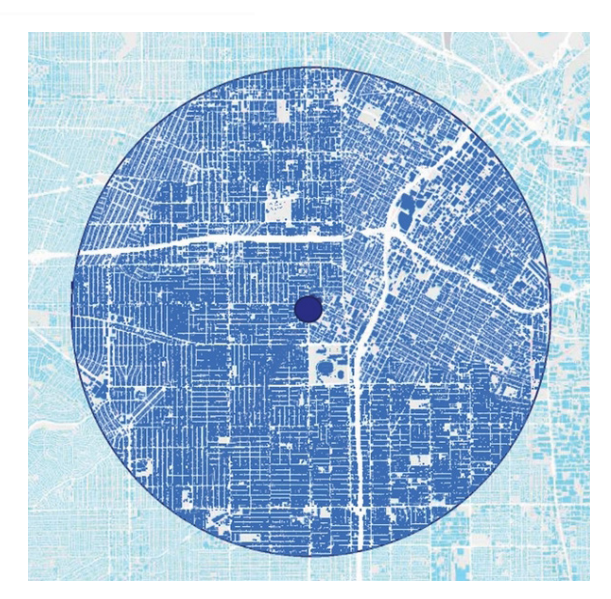
Neighborhood texture is the configuration of the structures in a given area. In this city map, the areas in dark blue have structures arranged in an especially orderly pattern.

HAZUS, the multi-hazard loss estimation tool developed and implemented by FEMA, focuses on climatological and structural risk factors in evaluating hurricane vulnerability.<sup>viii</sup> In considering which populations are vulnerable to hurricane damage, it does not account for social risk factors. Instead,