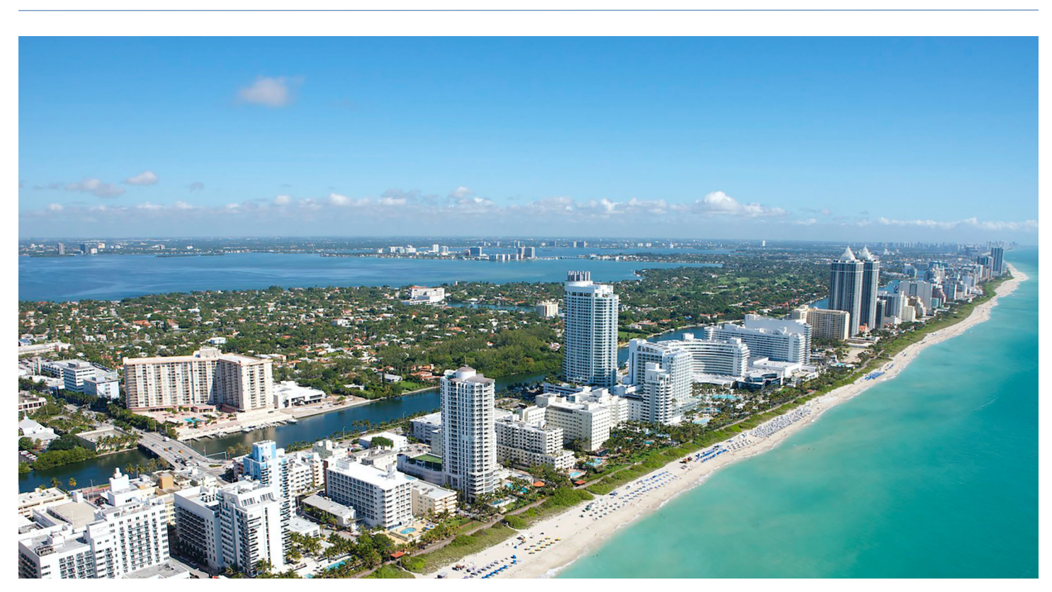
An aerial photograph of the city of Miami, Florida.

We found that 88,421 households are likely to be significantly cost burdened by hurricane losses and repairs. In Miami-Dade, almost every socially vulnerable group is overrepresented among these households.