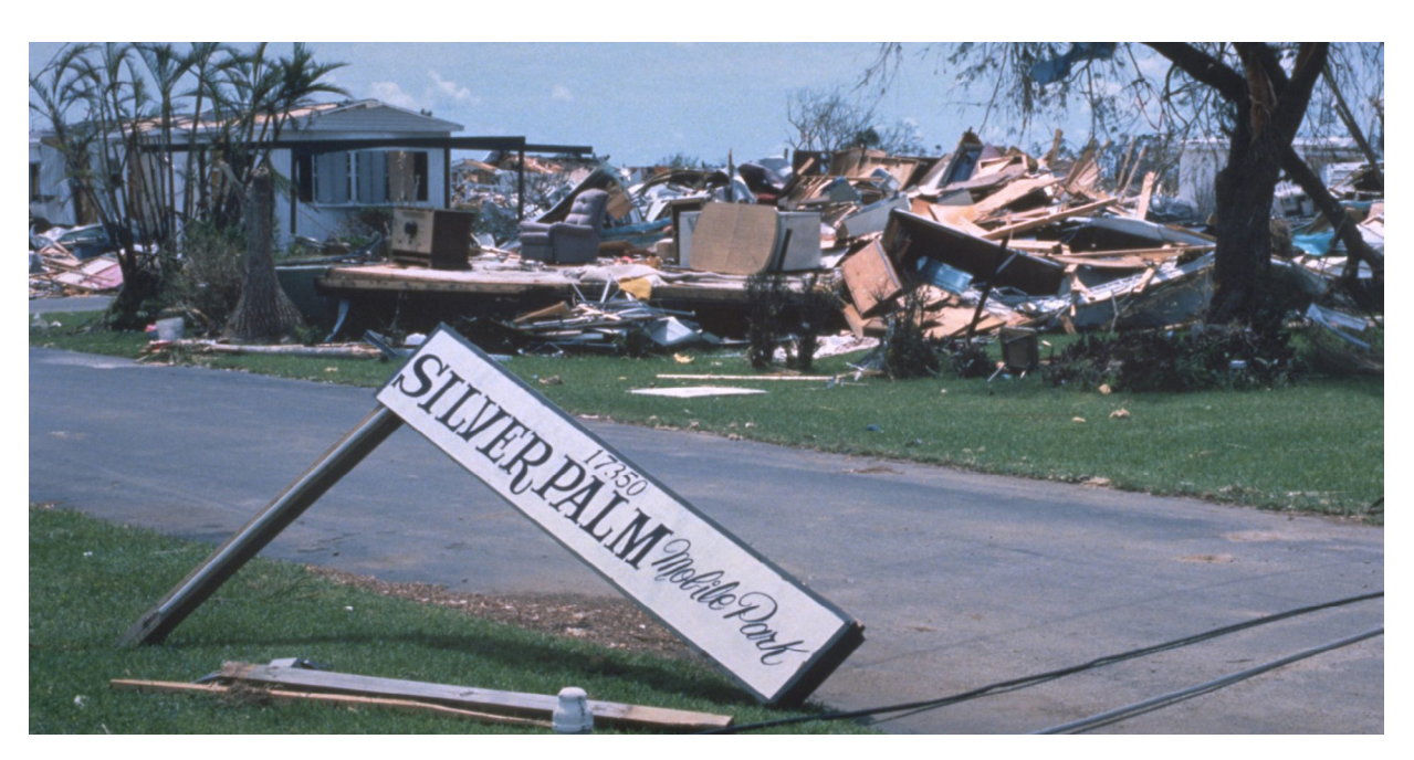
Silver Palm Mobile Park in Miami was devastated by Hurricane Andrew. After hurricanes, mobile home residents experience outsized losses and excessive cost burden compared to residents of multistory apartment buildings.