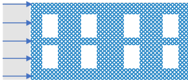
Lateral wind loading on a 2-story frame