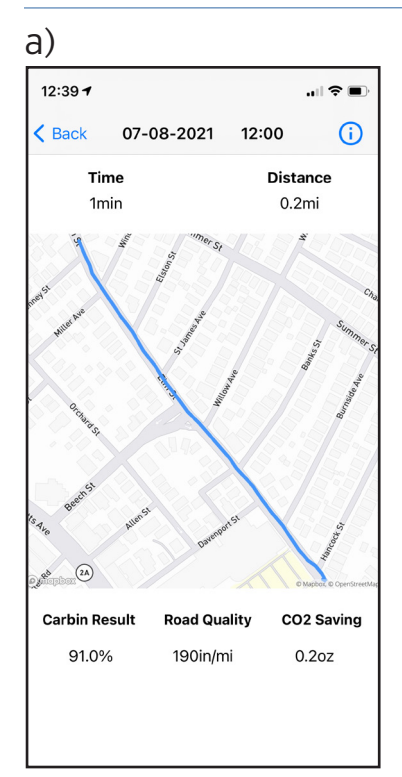
Figure 2. Carbin features an approachable and informative interface for both a) mobile and b) fleet users.

Carbin allows DOTs to relate pavement networks to the vehicles that drive on them—which, until recently, has proven impossible. This has made it a key research tool for CSHub and a promising analytics device for roadway data collection companies. Through further development, Carbin could become equally essential to DOTs as they meet the demand for <u>smarter</u>, <u>more interconnected road networks</u>.